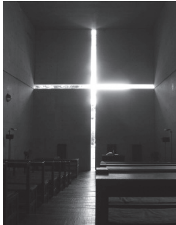
Fig. 3. Church of the Light

of the ever-changing character of light. Architecture, as the scene in which phenomena can be revealed, purifies light and brings it to our consciousness. Architecture helps light to be perceived as "Light", to show its character and capability.