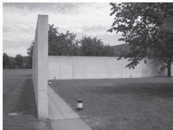
Fig. 4. Concrete walls to create enclosed domain, Seminar House, Weil am Rhein

In this sense, architecture creates an enclosed domain. The enclosed domain is actually a parallel action to the construction of place. To construct a place, it is necessary to delineate a distinct domain, an enclosure that denotes an interiority while preserving its links to the exterior. “Architecture ought to be seen as a closed, articulated domain that nevertheless maintains a distinct relationship with its surroundings” (Ando, 1990a, p. 457). Domains, as Norberg-Schulz (1979) shows, denote existential space and play an important role in “the language of architecture”. Moreover, as Frampton argues, in the current ubiquitous placelessness of the modern environment, a “bounded domain” could propose a resistance against that dilemma, so that “the condition of ‘dwelling’ and hence ultimately of ‘being’ can only take place in a domain that is clearly bounded” (Frampton, 2002a, p. 85). This bounded domain prepares a true place, weakens general placelessness, and leads to critical regionalism.