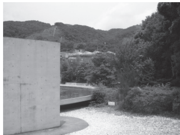
Fig. 1. Hierarchical approach to the Water Temple

The importance of movement for Ando can be seen in the way one approaches his buildings. Mainly in religious buildings, Ando avoids direct entry into the interior and presents a kind of hierarchical approach by using paths, pillars, walls, and colonnades (Fig. 1). This idea - like "perspectival perception" of Merleau-Ponty by which he acknowledges that perception is originally perspectival and there is no perspectiveless position - highlights the vital role of movement in perceiving the work of architecture and presents a "poetics of movement" as Plummer (2002) calls it.