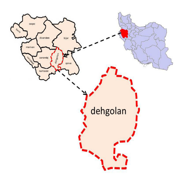
Fig. 2. Location of Dehgolan in Kurdistan Province