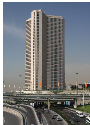
Fig. 1. A Single Tall Building in the Context of Tehran (www.skyscrapercenter.com)