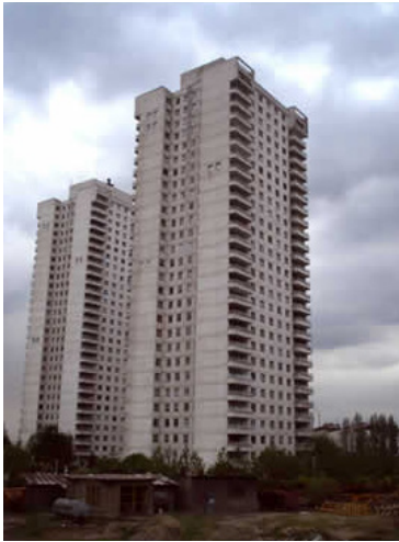
Fig. 2. Clustered High-Rise Buildings in the Context of Tehran