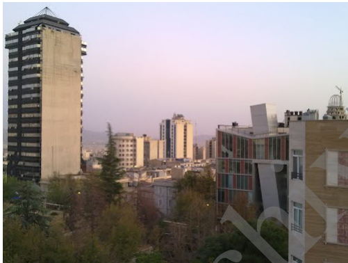
Fig. 3. A Tall Building with Designed Crown in Tehran