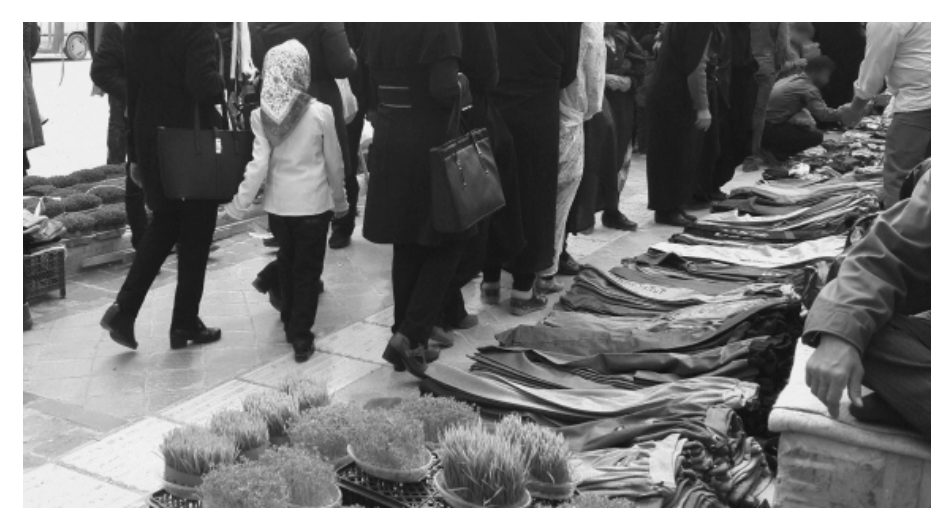
Fig. 3. Vendors in Beheshti Street

The vendors mentioned by the respondents were also a cause of the attractiveness of the street for those on low incomes, especially the villagers (Fig. 3).