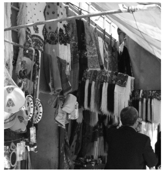
Fig. 2. Turkmens' Specialized Shops in Beheshti Street