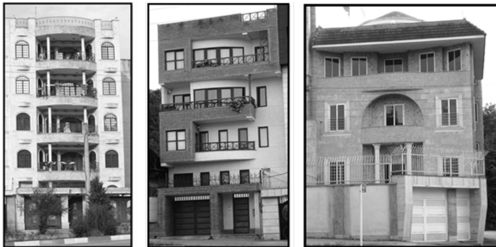
Fig. 1. Examples of Photo of the Building Facades Rated in Photo Questionnaire

Then a professional photographer was invited to select the 100 photographs among a collection of 500 photographs in order to ensure that only appropriate and good quality images were selected. Due to avoiding personal and deliberate choices out of wide range of different building facades, a group of five architecture experts were asked for selection of 48 photographs out of 100 photographs. Samples of these photos are displayed in Fig. 1. By adding two photos to the first and two photos to the end, the number of displayed slides was 52 slides, although the data related to these 4 photos was not analyzed. The first two photos were removed due to the possibility of misunderstanding of the questions and the last two photos were removed due to the possibility of tiredness which can lead to invalid response.