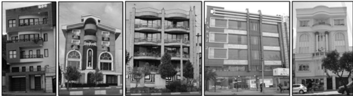
Fig. 4. Five Best Selected Building Facades from Left to Right