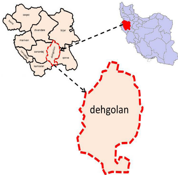
Fig. 2. Location of Dehgolan in Kurdistan Province