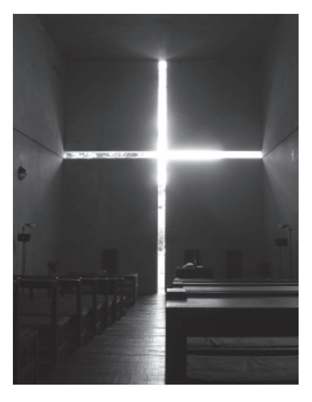
Fig. 3. Church of the Light

of the ever-changing character of light. Architecture, as the scene in which phenomena can be revealed, purifies light and brings it to our consciousness. Architecture helps light to be perceived as "Light", to show its character and capability.