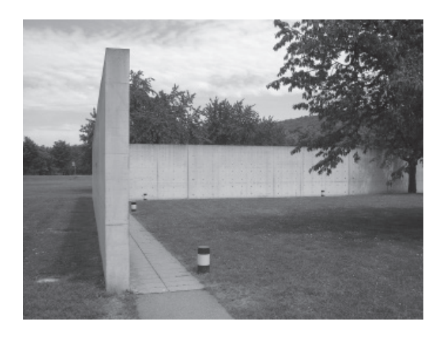
Fig. 4. Concrete walls to create enclosed domain, Seminar House, Weil am Rhein

In this sense, architecture creates an enclosed domain. The enclosed domain is actually a parallel action to the construction of place. To construct a place, it is necessary to delineate a distinct domain, an enclosure that denotes an interiority while preserving its links to the exterior. "Architecture ought to be seen as a closed, articulated domain that nevertheless maintains a distinct relationship with its surroundings" (Ando, 1990a, p. 457). Domains, as Norberg-Schulz (1979) shows, denote existential space and play an important role in "the language of architecture". Moreover, as Frampton argues, in the current ubiquitous placelessness of the modern environment, a "bounded domain" could propose a resistance against that dilemma, so that "the condition of 'dwelling' and hence ultimately of 'being' can only take place in a domain that is clearly bounded" (Frampton, 2002a, p. 85). This bounded domain prepares a true place, weakens general placelessness, and leads to critical regionalism.