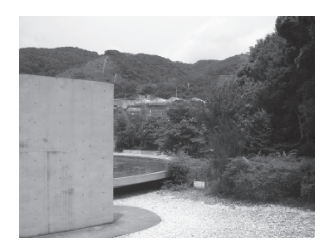
Fig. 1. Hierarchical approach to the Water Temple

The importance of movement for Ando can be seen in the way one approaches his buildings. Mainly in religious buildings, Ando avoids direct entry into the interior and presents a kind of hierarchical approach by using paths, pillars, walls, and colonnades (Fig. 1). This idea – like "perspectival perception" of Merleau-Ponty by which he acknowledges that perception is originally perspectival and there is no perspectiveless position – highlights the vital role of movement in perceiving the work of architecture and presents a "poetics of movement" as Plummer (2002) calls it.