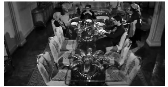
Fig. 15. Dinnertime in modern times. From "Where to with this Hurry?"

For example, a small and cozy interior space, which could be used for a variety of different activities changed into a series of interior spaces that were designed for specific activities. Later, these spaces were replaced by a large interior space that was divided into different activities using furniture. Thus, furniture began to have a more prominent role and its design began to influence the interior architecture of homes. Within these transformations, the carpet lost its role as the central, horizontal surface that brought everyone together. Instead it became a decorational piece that was placed in relation to the furniture. Thus, the Iranian carpet became marginalized and eventually lost within other ornamental elements of interior space (Figs. 14 and 15).