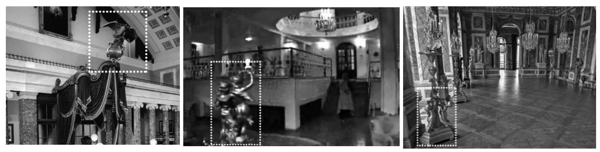
Fig. 19. Eagle Sculpture in the old senate room, Congress Building, Washington, 1803-11 (Gura & Pile, 2013, p. 226)

Fig. 20. Nude statuettes from "Where to Fig. 21. Nude statues, Hall of Mirrors, with this Hurry?"