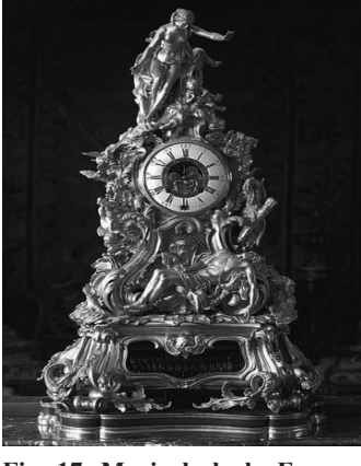
Fig. 17. Musical clock, France, 1756, (Gura & Pile, 2013, p. 178)