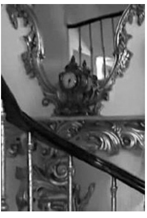
Fig. 16. Golden clock and decorations from "Motherly TV series"

Perhaps the public and the experts ignore these forms and references as personal preferences. But, it seems more likely that they have come to accept them as symbols of wealth, power and even cultural progress. In either way, such interior spaces, commissioned by the wealthy and produced by many contemporary Iranian designers, are being popularized by the mass media and are rapidly altering the Iranians' conception of nobility, quality and richness in architecture.