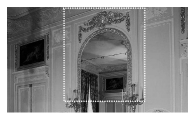
Fig. 13. Gold decorations in the Palace of Versailles, near Paris, France, 1762, (Pile & Gura, 2013, p. 180)

In many homes in modern Iran, the color gold is a direct translation of a desire to show off wealth and power, even though the owners cannot afford the real metal itself. The resultant effect is a superficial representation of gold, which has become quite widespread due to its availability. Unfortunately this golden make-up has so far seemed adequate for all people involved.