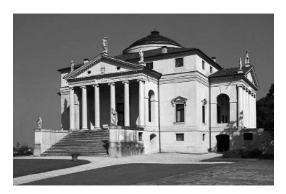
Fig. 5. Villa Rotunda, Andrea Palladio, Italy (Pile & Gura, 2013, p. 140)