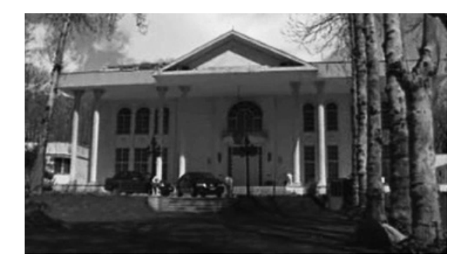
Fig. 4. Building portrayed in "A Traveler from India"

Fig. 3. The composition of building facades showing the symmetry, the division into three sections and the emphasis on the middle section. Only the building portrayed in the "Shams-ol-Emarch" TV series is divided into five sections.