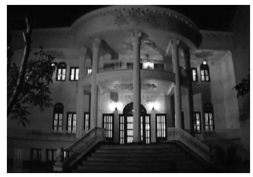
Fig. 10. Corinthian columns used in the house portrayed in "Where to with this hurry? " and "Endless Journey"

and palaces of the Achaemenid period (Mahmoudi, 2005, p. 55). Yet, in many modern buildings, Ivans have been reduced to tiny protrusions in the façade that are no places to sit and enjoy a family gathering. Instead, these spaces are for standing and watching over the garden, even perhaps to acknowledge the people standing down below. While in traditional architecture, the Ivan was an internal component of the house, looking towards the private interior courtyard, which defined the heart of the extended family, this new terrace is an external component of architecture that looks towards the outside landscape or even the street.