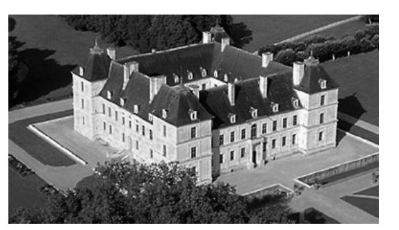
Fig. 7. Chateau d'Ancy-le-Franc

Figs 4-7. Possible sources of inspiration for architectural style. The buildings on the left are the houses portrayed in the TV Series and the ones on the right are possible precedents. Notice the columns and the pediment of Neoclassical Architecture and the high-pitched roofs of French Renaissance Architecture used as stylistic guides.