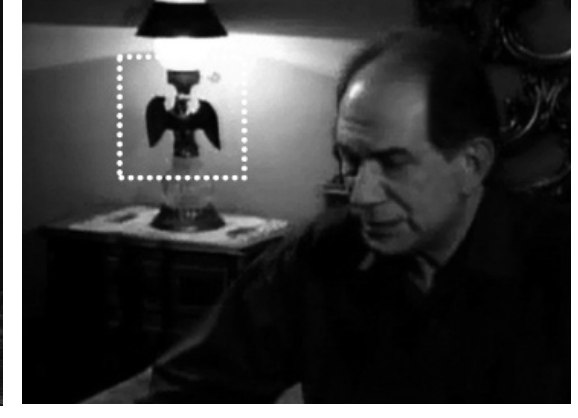
Fig. 18. Eagle sculpture from "Endless Journey"