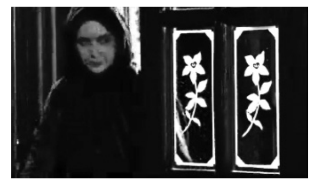
Fig. 22. Frosted glass windows from "Where to with this Hurry" is reminiscent of frosted glass panes of windows in Christmas Carol Stories popularized by Western mass media.

The images that the mass media offers the viewer are both a reflection of public taste and also a powerful force in directing them. In such a setting, minor details can have major effects. For example, most of the scenes used to depict the home in contemporary Iranian TV series, are composed of shots taken at night and with artificial lighting. This is perhaps because nighttime is when most of the members of the family are together at home. However, another reason could be the image of luxury produced by artificial lighting. Thus, in modern homes, artificial lighting acts as another layer of embellishment, furthering the expression of luxuriousness: anyone who can afford this much artificial lighting for the inside and outside of his house must be a very important person indeed!