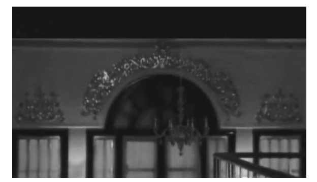
Fig. 12. Golden decorations of the house in "Endless Journey TV Series"

Perhaps the most immediately noticeable characteristic of a home is the color used for its wall surfaces. These colors set the mood of the interior space and express the owners' tastes and personality. In half of the houses studied in this research<sup>14</sup> the color gold is deliberately used in different interior spaces, not only to evoke a sense of luxury and wealth, but also to distinguish the spaces from