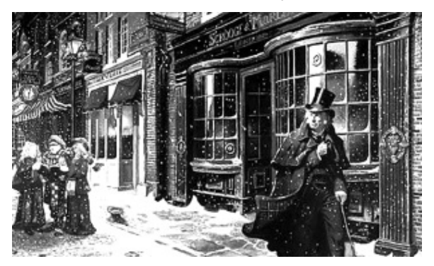
Fig. 23. Scrooge leaving his office on Christmas eve. Notice the frosted glass windows. Image by Dean Morrissey, (1843) (www.swoyersart.com)

In this manner, artificial light begins to replace natural light even though none of these buildings have any restrictions in accessing natural light. The result is a series of spaces that are dark, despite the artificial lighting, and inward looking, despite the many opportunities to engage with the natural space outside. Even the windows are reminiscent of climates and architectural traditions in which the home protects its occupants from the harsh weather outside. For example, in one scene, we witness windows with glass panes that are frosted around the edges, with flowers etched into the center. This is reminiscent of windows of houses in colder climates, when around Christmas, frost builds up on the window seals and the occupants hang flowers on the door to celebrate the festive season. Perhaps these windows have been etched into the Iranian psyche via images of Christmas Carol stories disseminated by the mass media.