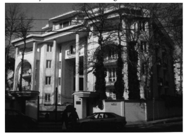
Fig. 1. An image of a good style for architecture, chosen by contemporary Iranian people. (Sadegh Zadeh, 2013, p. 48)

The question that gains significance here is that what do clients define as good quality architecture? In other words, how does society (and the potential clients within it) define richness, quality and novelty in architecture? This research approaches this question through mass media, particularly the television, as both a reflective device and a powerful manipulator of public opinion. The question is whether in their definition of good architecture, the wealthy clients who instigate large architectural projects, place any significance on Iranian identity and traditional concepts, or whether, in fact, recent architectural developments are a reflection of a desire to surpass what is considered to be old and outdated styles and models of thought?