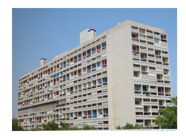
Fig. 2. Unite De Habitation, An Influential Residential Complex

In fact, precedence of multi unit residential building typology, like much of modern architecture, can be traced back to Le Corbusier. The precedent for large multi unit dwellings was set at Le Corbusier's "Unite d' Habitation" in Marseilles (1947-1952), which was one of the century's most influential buildings which would later be mirrored across America for apartment style housing. The giant, twelve-story apartment block for 1.600 people is the late modern counterpart of the mass housing schemes of the 1920s, similarly built to alleviate a severe postwar housing shortage. Its influence on subsequent developments in city planning is clear - notably on postwar reconstruction in Europe and public housing in the United States (Bouliane, 2010).