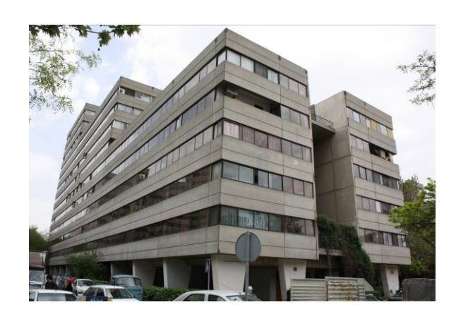
Fig. 3. Ekbatan Residential Complex, Tehran, an Early Example of Modern Residential Complex Influenced By Thoughts of Le Corbusier

The technology of prefabrication had become applicable to housing projects since the 1970's making pre-cast modules and forms available for an abundance of uses, which was adopted for construction of masshousing projects all over the globe. In Iran too, most of the early residential complexes were constructed utilizing precast and prefabricated elements.