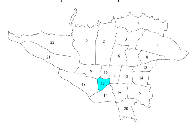
Fig. 1. The Location of District 17 in Map of Tehran (2018)

District 17 is located in south of Tehran and is a lowquality urban area that is more unsafe and has a lower standard of living. Fig. 1. shows the situation of district 17 in current map of Tehran Metropolis.