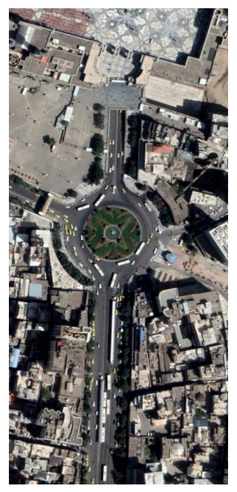
Fig. 2. Imam Reza (PBUH) Street and its Connection to the Holy Shrine through Beytol Moghaddas Square and Bab al-Reza (Google Earth)

Imam Reza (PBUH) street of Mashhad city is located in the historical and central part of Mashhad city. In this street, as we approach the holy shrine of Imam Reza (PBUH), the social role of the street is highlighted more. Imam Reza (PBUH) street is one of the main access paths to the holy shrine. Imam Reza (PBUH) street has thousands of pilgrims daily, considering its commercial-residential role, and leads to the formation of the various behavioral patterns of users in this urban space. In the current study, a part of Imam Reza (PBUH) street that is located adjacent to the holy shrine and is between the Beytol Moghaddas Square (Ab Square) and the holy shrine, and many pilgrims are present in that street. Therefore, this area has been considered as the study area. The length of this street before the square and to the entrance of the holy shrine is approximately 400 meters (Fig. 2).